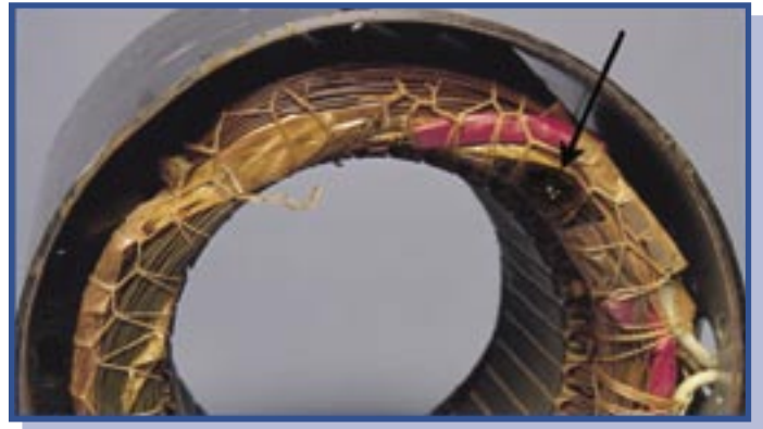
This winding fault was caused by a voltage surge. An insulation test will not detect it!

The ALL-TEST PRO® is your best choice for fault detection and troubleshooting.